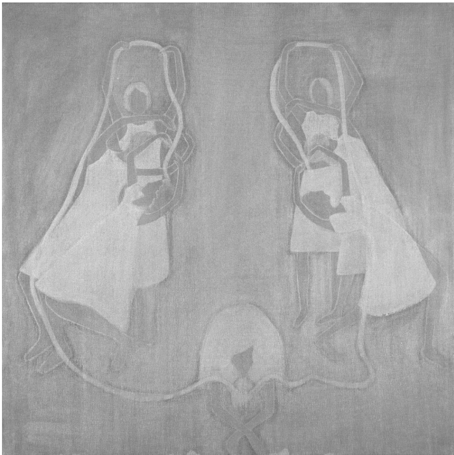
The Bride's Chamber Scene Watercolour and gouache on canvas, 100 × 100 cm (Silke Otto-Knapp, 2005)