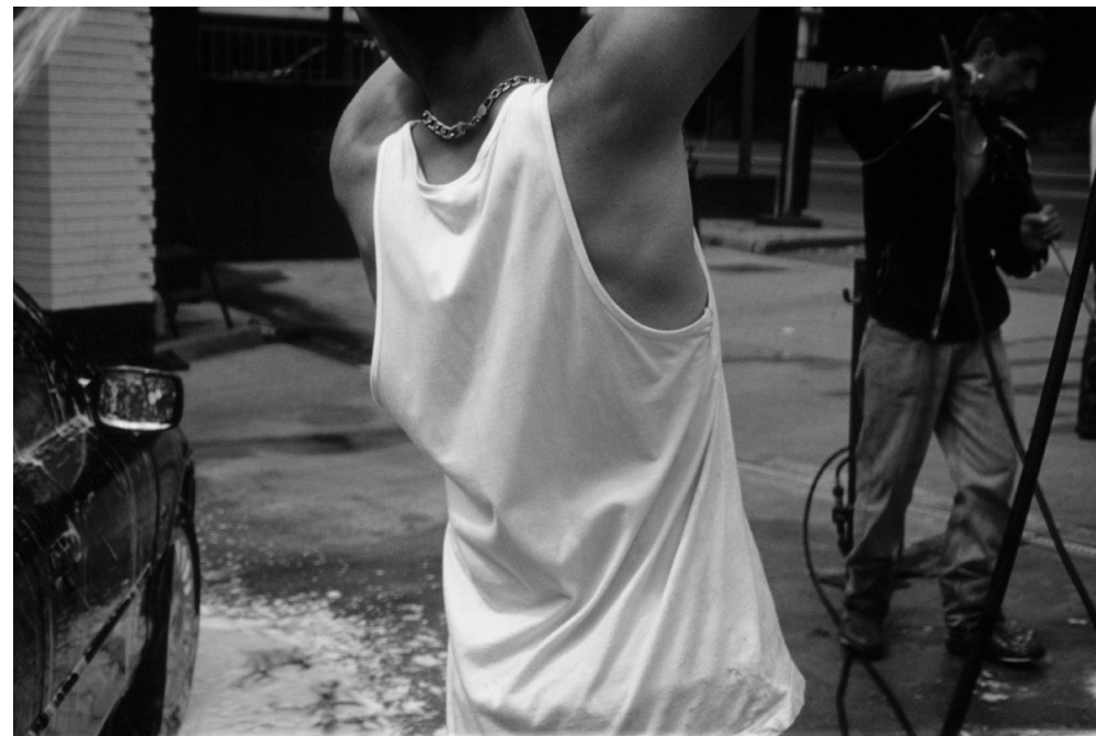
Car Wash 4 × 80 slides, 4 × Kodak Ektapro 5020 slide projectors, 4 × Unicol projector stands (Hilary Lloyd, 2005)